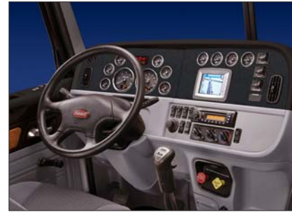
The ergonomic Prestige cab interior features a new charcoal dash that reduces glare improving driver visibility, is scratch resistant and provides LED backlit gauges and a powerful new HVAC system for improved overall performance.