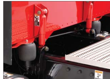
Peterbilt's Unibilt® cab sleeper system combines the cab and sleeper into a single structural unit with an independent dual air bag and shock absorber suspension for an exceptionally smooth ride.