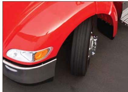
A new chassis design features optimized front axle placement for outstanding maneuverability and handling. Components are positioned for convenient access to key service points.