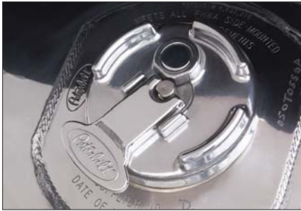
The signature Peterbilt fuel cap is mounted to a precision-crafted aluminum fuel tank, and is a distinctive representation of the outstanding fuel economy of the Model 384.