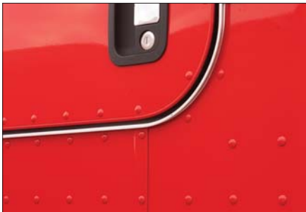
A lightweight all-aluminum cab with huckbolt fasteners, lap seam construction and bulkhead style doors is the leader in toughness, corrosion resistance and water-tight performance.