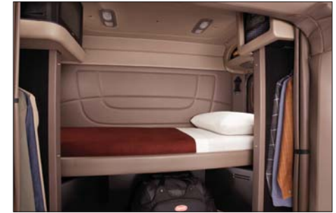
The comfortable 63" Platinum sleeper features closets and cabinet doors with woodgrain accents while the Prestige sleeper has vinyl curtains and net enclosures. Both configurations feature shelving for amenities, Xenon lighting and a convenient control panel near the bunk.