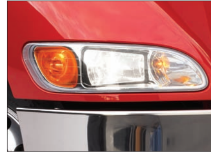
The sloped hood and high-intensity forward lighting system provide improved visibility. The tough Lexan® lens is impact resistant and no special tools are required for lamp adjustment or bulb replacement.