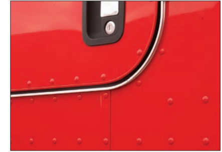
A lightweight all-aluminum cab with huckbolt fasteners, lap seam construction and bulkhead style doors is the leader in toughness, corrosion resistance and water-tight performance.