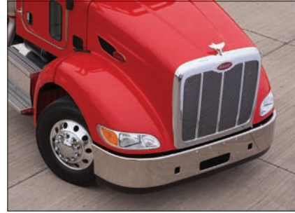
A sloped hood with swept-back fenders and integrated headlamps features a stainless steel grille with chrome surround and standard chrome bumper for aerodynamics with a touch of class.