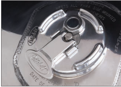
The signature Peterbilt fuel cap is mounted to a precision-crafted aluminum fuel tank, and is a distinctive representation of the outstanding fuel economy of the Model 384.