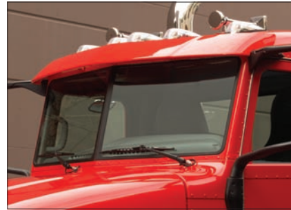
A contoured sunvisor was designed using Computational Fluid Dynamics and extensive wind tunnel testing. A two-piece windshield allows for cost-efficient glass replacement.