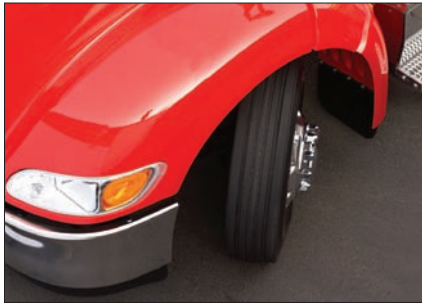
A new chassis design features optimized front axle placement for excellent maneuverability and handling. Components are positioned for convenient access to key service points.