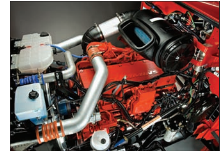
Two engine options are available on the Model 384 Day Cab which include the Caterpillar C13 and the Cummins ISM for HP ratings of up to 470 HP.

The versatile Model 384 Day Cab combines maneuverability with high performance and durability. For more information on the Model 384 Day Cab, contact your local Peterbilt dealer, visit www.peterbilt.com or call 1-800-552-0024.