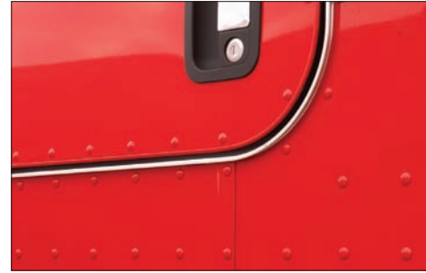
A lightweight all-aluminum cab with huckbolt fasteners, lap seam construction and bulkhead style doors is the leader in toughness, corrosion resistance and water-tight performance.