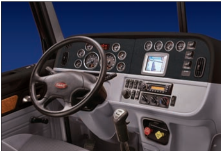
The ergonomic Prestige cab interior features a new charcoal dash that reduces glare improving driver visibility, is scratch resistant and provides LED backlit gauges and a powerful new HVAC system for improved overall performance.