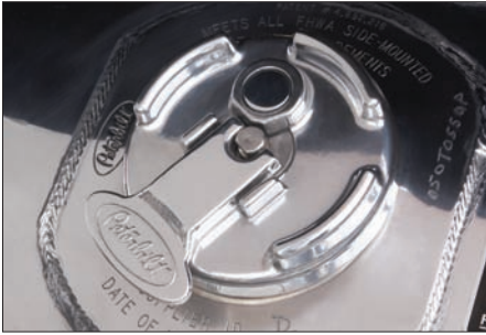
The signature Peterbilt fuel cap is mounted to a precision-crafted aluminum fuel tank, and is a distinctive representation of the outstanding fuel economy of the Model 386 Day Cab.