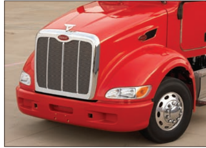
A dramatically sloped hood with swept-back fenders, a contoured, advanced composite bumper and aero tool box to enhance aerodynamics.