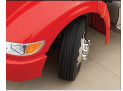
A new chassis design features optimized front axle placement for excellent maneuverability and handling. Components are positioned for convenient access to key service points.