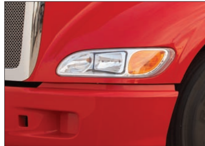
Integrated headlamps provide a high-intensity forward lighting system for improved visibility and a tough Lexan lens is impact resistant and requires no special tools for lamp adjustment or bulb replacement.